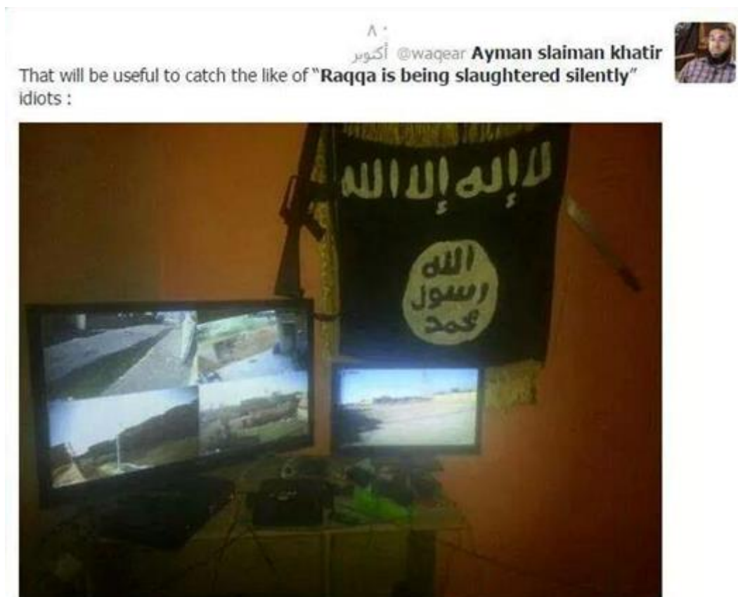
Image 1: Example of an online threat made against RSS. The image, which cannot be confirmed, purports to show CCTV installed around Raqqah.

hasn't escaped ISIS' notice, and the group has been targeted for kidnappings, house raids, and at least one alleged targeted killing. At the time of writing, ISIS is allegedly holding several citizen journalists in Ar-Raqqah.